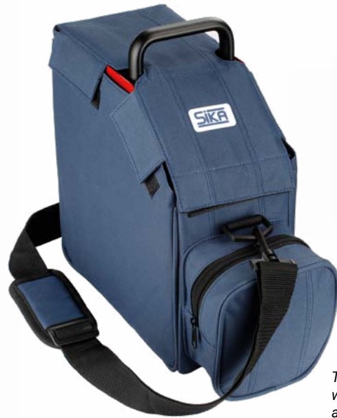
TP Basic Marine set with calibration inserts and transport bag