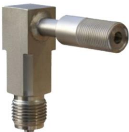
Optional angle adaptor

Specifications of the product may be changed without notice