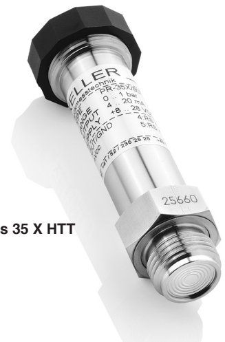
Series 35 X HTT