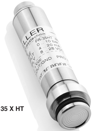
Series 35 X HT

With the KELLER software READ30 and PROG 30, a RS485 converter (i.e. K-102, K-104 or K-107 from KELLER) and a PC, the pressure can be displayed, the units changed, a new gain or zero set. The analog output can be set to any range within the compensated range.