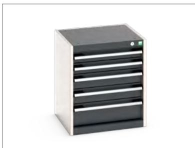
Workshop base cabinets