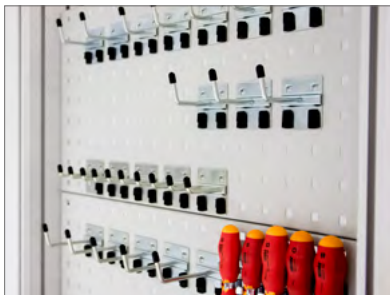
Perforated plate accessories

We at ELABO are experts in the entire field of workplace solutions and will be happy to create a coherent overall concept for you, including accessories. For this purpose, our expert planners will record all important criteria on site and coordinate them with you.