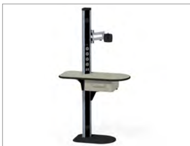
Repair reception column