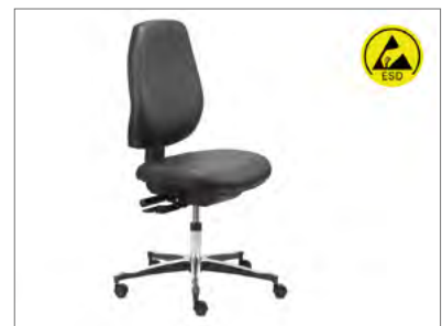
(ESD) chairs and standing aids