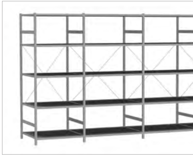
Heavy duty shelves

Tidiness is the basis for efficient work. And we have the right solutions for this. Starting with tall cabinets to (mobile) side cabinets or workbenches with drawer cabinets. We will be happy to advise you on individual storage space solutions for your requirements.