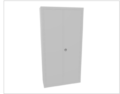
Steel and wooden cabinets