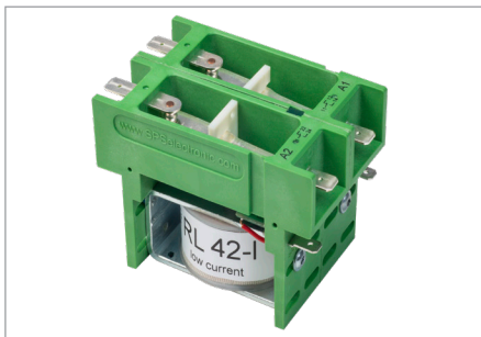
High voltage relay RL 42-I, up to 5,000 V, low current