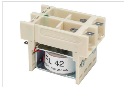
High voltage relay RL 42, up to 5,000 V