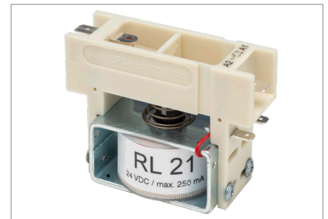
High voltage relay RL 21, up to 5,000 V