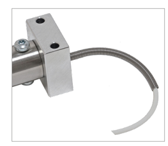
Sensor attachment Bending protection