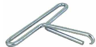
AE201 Tensioning Hook