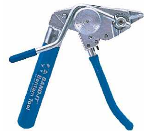
C075 Bantam Tool