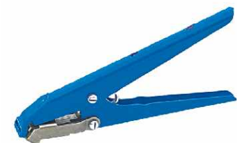
AE200 Cable Tie Tensioner