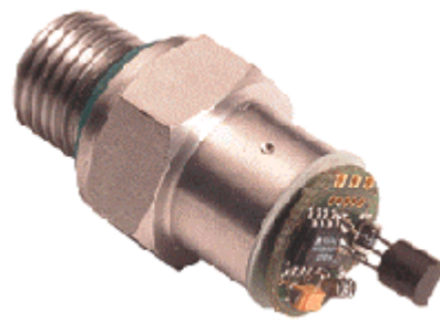
Series 20 S